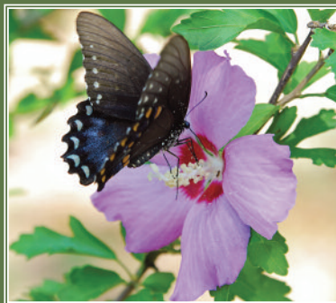
Hibiscus Syriacus Rose-of-Sharon